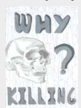
Inès Lazghab Collège Édouard-Vaillant, Gennevilliers - France

The 4 winning drawings from the 2014 edition of "Draw Me the Abolition".