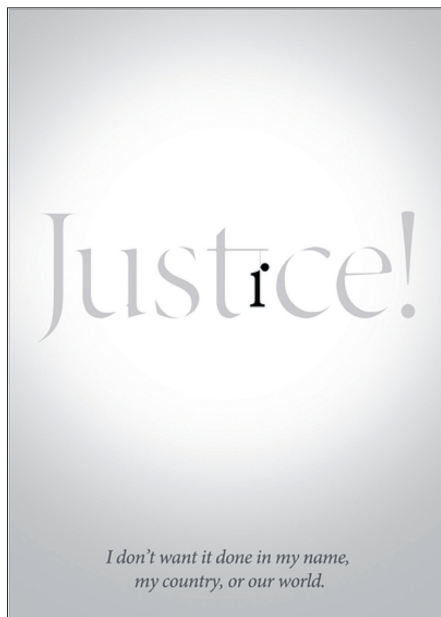
Selcuk Ozis, Great Britain

The goal of this session is to observe how various graphic artists played with typography to illustrate a particular aspect of the application of the death penalty across the world.